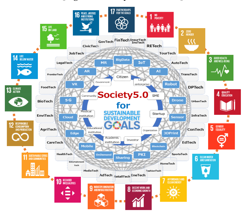
[Figure 2 Society 5.0 for SDGs]

management; (6) avoiding costly unplanned downtime for a number of industries; and (7) enabling new and improved products and services. At the same time, we recognise the necessity of public-private collaboration so that no one will be left behind by this transformation. For this purpose, it is imperative for governments to take concrete and immediate policies and measures in the seven areas which are set out below, in close consultation with business.